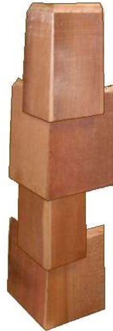
4-Piece Flush corner set. 2 of each piece per bundle

After installation, apply a 1/4" bead of exterior rated caulking to the edge of the plywood backer on each side of the corner piece. Shingle panels are trimmed square and butted to the corner. Take care to limit caulk from squeezing onto the face of the panel. Nail panels per application instructions.