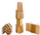
Matching Flush 90° Corner Bundle

You don't cut corners on your home; we don't either. Our mills source only the highest grades of Western Red Cedar, all sustainably grown and harvested in the Pacific Northwest. Did you know you can install Cedar Valley products yourself using basic tools? This saves you time and money so you can get right back to enjoying your life.