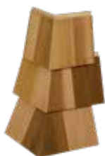
3-Piece Flare Corner Set

Your family deserves a house that's distinctive, creative, and timeless. Customized design with quality cedar enhancements can set your home apart for years to come.