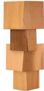
Flush 135 Corners (for Bay Windows)